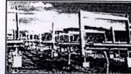
Altrac Accelerated Exposure

The changes in appearance and performance of materials with exposure to weather and the passage of time are, alas, familiar to us all. Indeed, Pliny the Elder in the first century AD reportedly listed corrosion and weathering of materials among man's chief enemies.